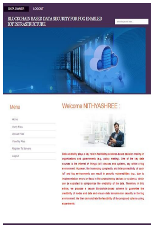
Fig 6: Home page of data owner

Figure 5 shows the fog server home page where a welcome is displayed after the fog login and concept is also displayed. At the left of the home page thereare several tabs such as, view users, files with public key, public key permission, generate private key, generate cipher key, and log out. Fog server is mainly use to generate keys.