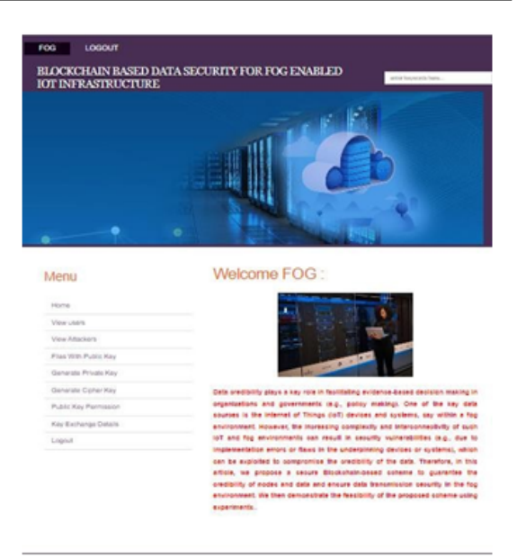
Fig 5: Home page of fog

Figure 4 shows the cloud server home page where a welcome is displayed after the cloud login and concept is also displayed. At the left of the home page there are several tabs such as, view users, owner files, files with public key and log out. Cloudserver act as a storage system.