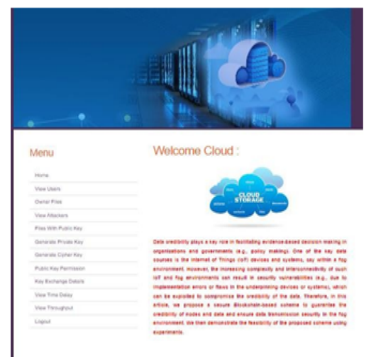
Fig 4: Home page of Cloud server

Figure 3 shows home page of blockchain based system for fog enabled IoT infrastructure where it displays the name of the project and concept of the project. Different members of the system are mentioned at the top. By clicking on any one of the members it will direct to the home page of that member.