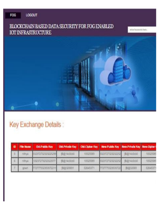
Fig 9: Key exchange details

project. At left side there will be menu like my profile, view files, request public key, public key response, download file and various other menu.