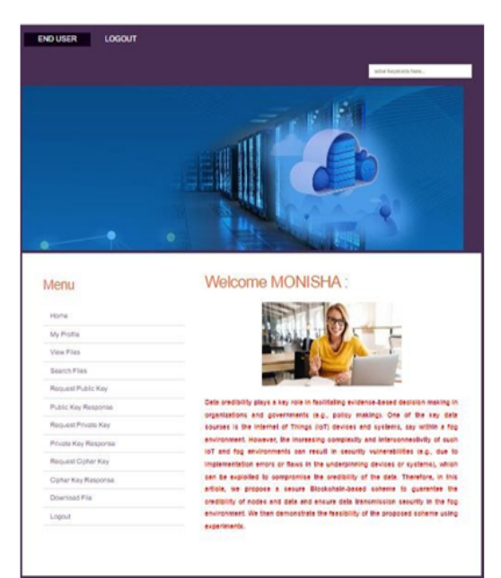
Fig 8: End user home page

Fig 7: Data owner uploading file page Figure 7 shows encrypted file and the hash code generated and data owner can upload the file.