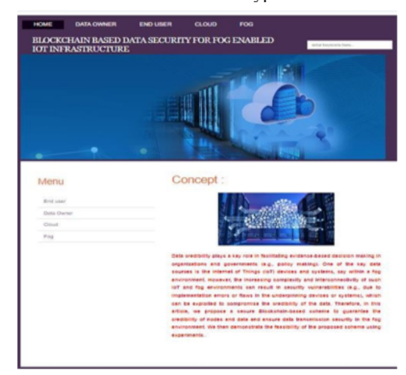
Fig 3 : Home Page of the system

privacy and security issues raised by using traditional database storage. The result of using blockchain and AES based encryption is discussed.